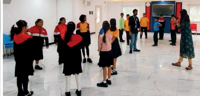
The SpringUP Experience: Cultivating Healthy Relationships!